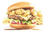
Crispy Jalapeño Burger