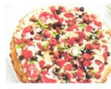
BJ's Favorite Deep Dish Pizza

Valid for dine in or take out. Not valid towards alcoholic beverages or Happy Hour specials. Please do not distribute flyers on-site during the event. Flyers must be printed and presented to the server.