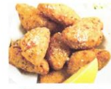
Crispy Fried Artichokes