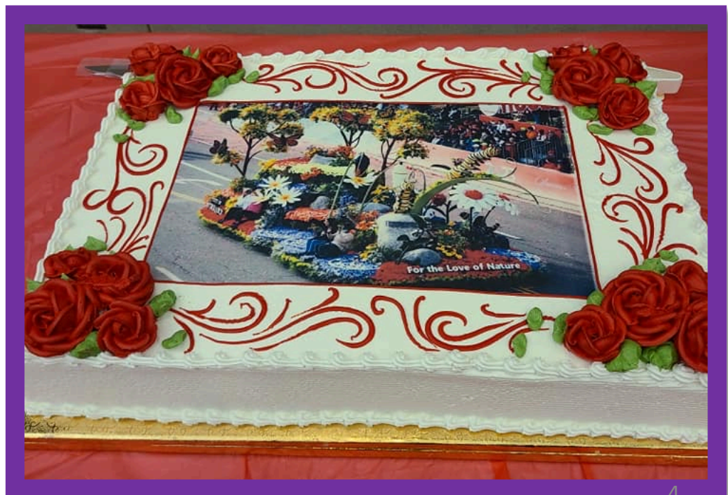
The dessert cake with a beautiful photo of our award-winning float!