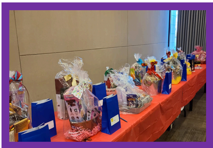
There were opportunity baskets galore!