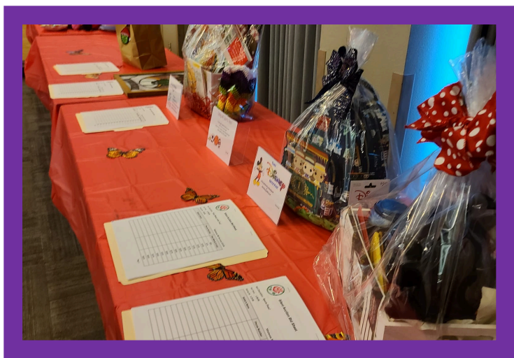
Silent auction items were a big success and help us raise funds!