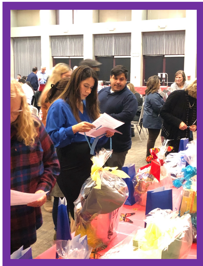
Guests perusing the wide selection of opportunity baskets.