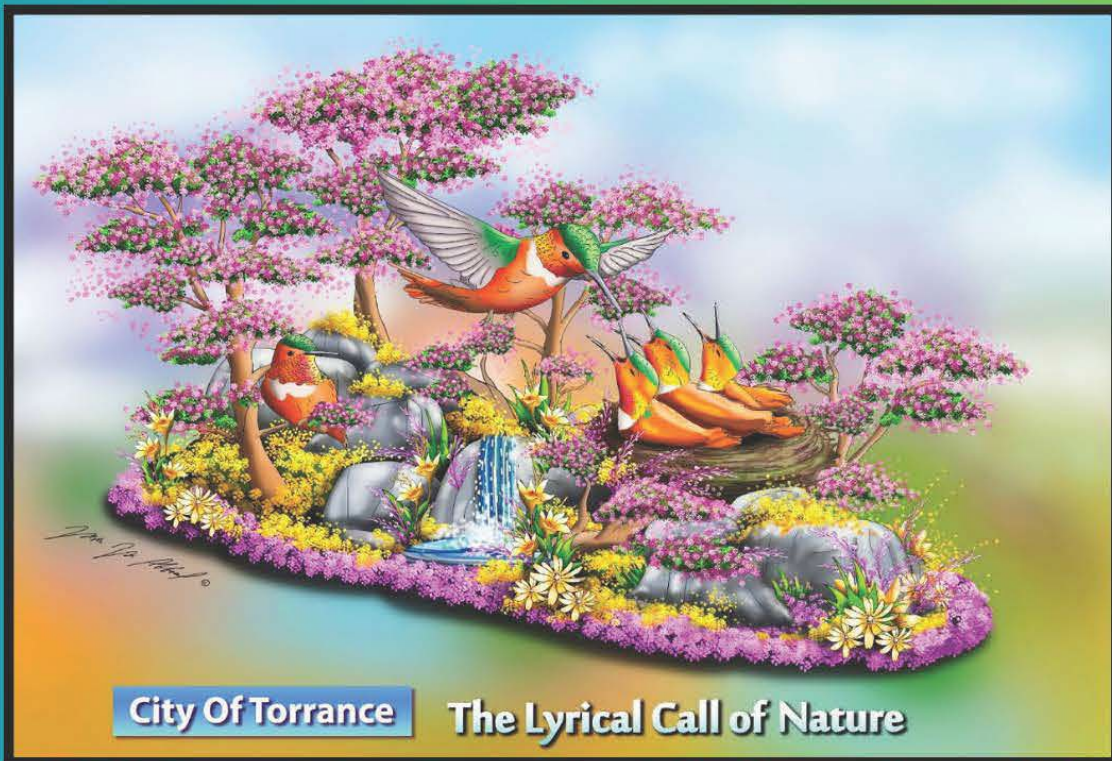
City Of Torrance The Lyrical Call of Nature