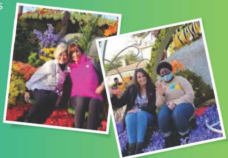
2023 float riders