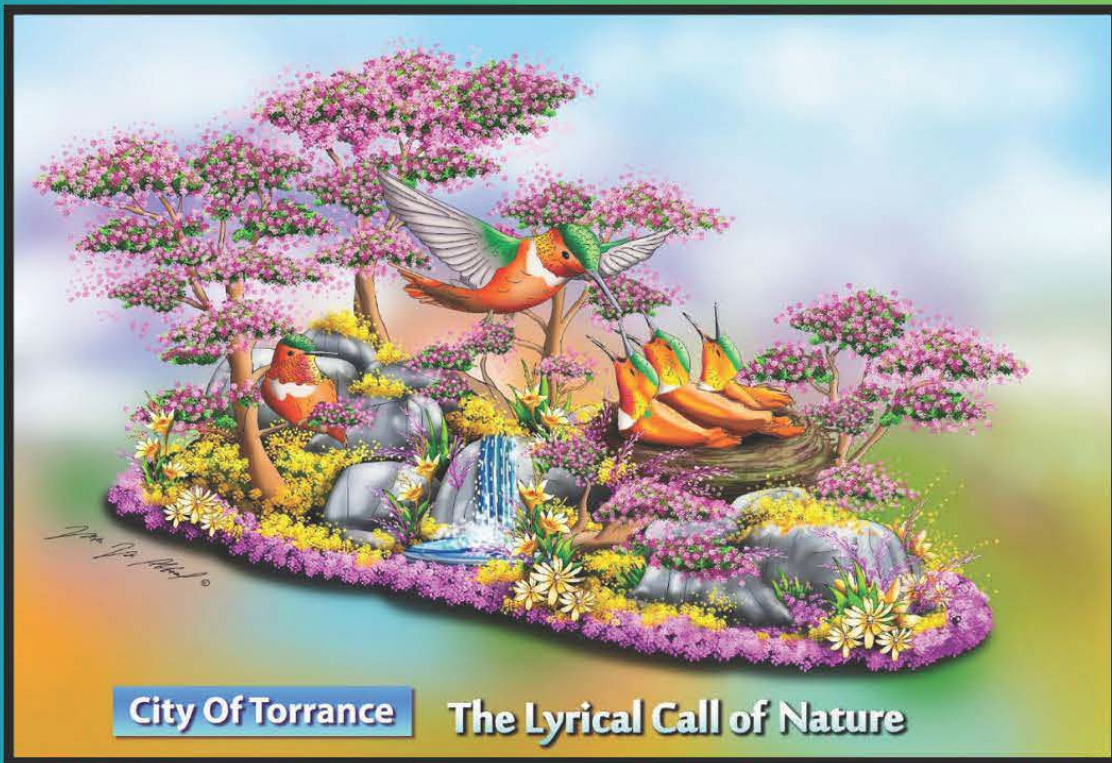
City Of Torrance The Lyrical Call of Nature