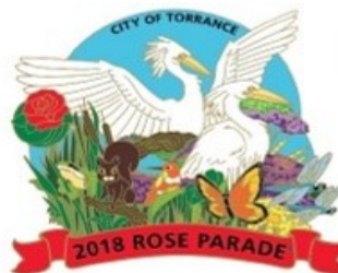
2018 Float Pin