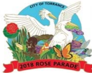
2018 Float Pin

(limited quantities and sizes available)