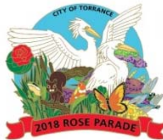
2018 Float Pin