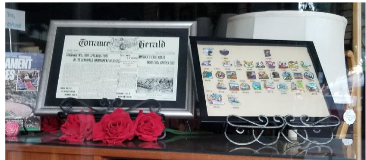
1914 Torrance Herald and collection of TRFA Pins.

2021 is the 50 th Anniversary of the Torrance Rose Float Association! If you have any memories or ideas for a celebration that you would like to share contact us at one of the sites above. We would love to hear from you!